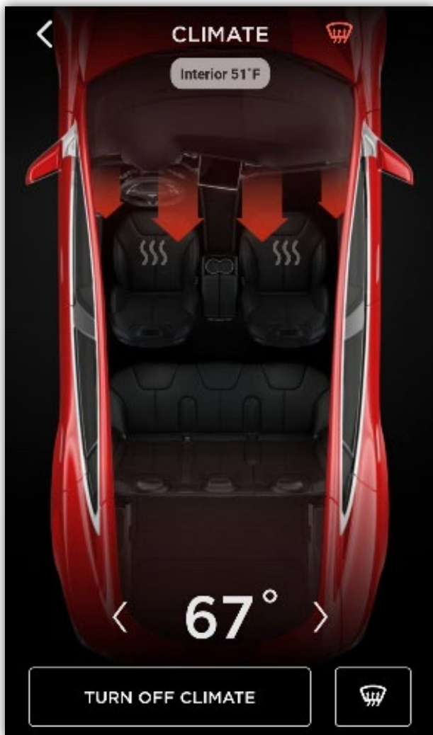
Set your climate control timer and get into a comfortable car

So warm up or cool down your car while you're getting ready to head out and never get into an uncomfortably hot or cold vehicle again!